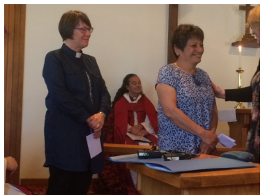
Photos taken at Newlands Graduation.

God who is love, You hear us and are present with us wherever we are. We ask that you help us find hope in the midst of hopelessness, And order in the midst of chaos, So that we may be witnesses to you and grow your kingdom. Through Jesus Christ we pray. Amen