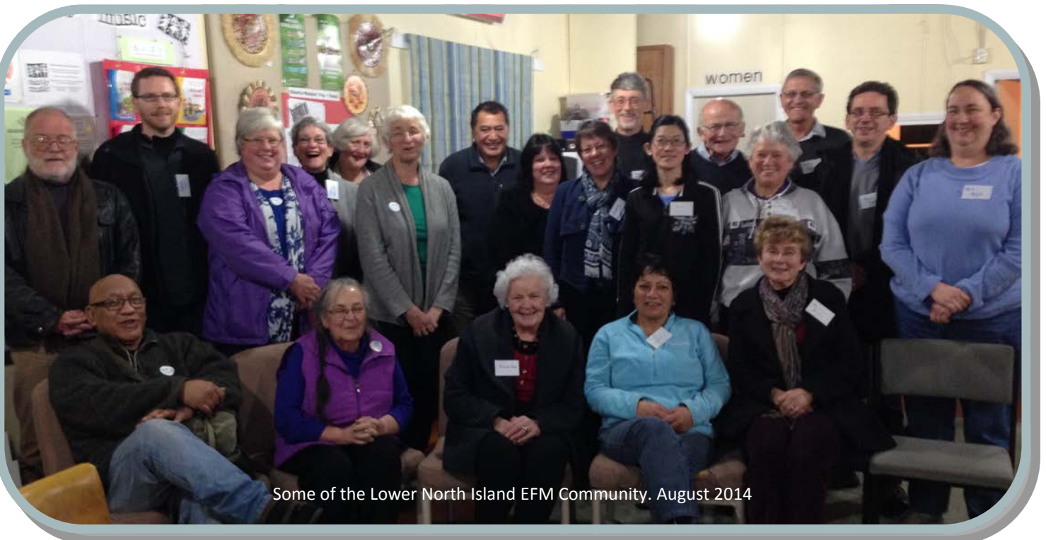
Some of the Lower North Island EFM Community. August 2014