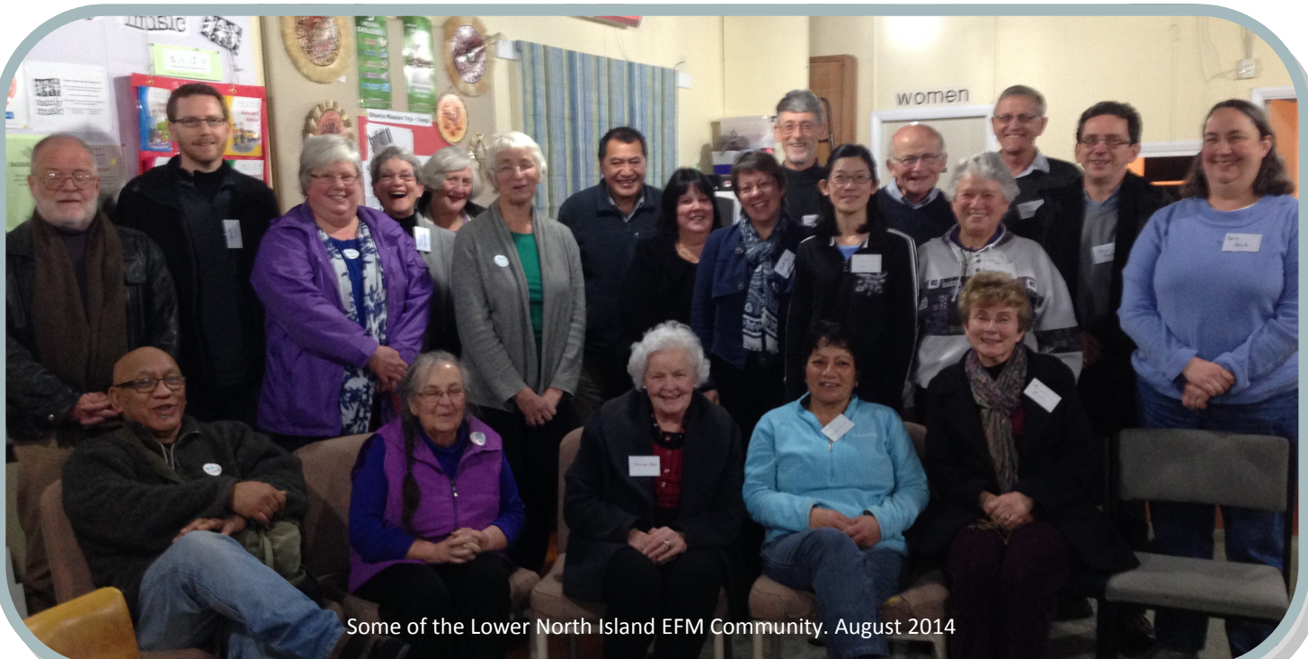
Some of the Lower North Island EFM Community. August 2014